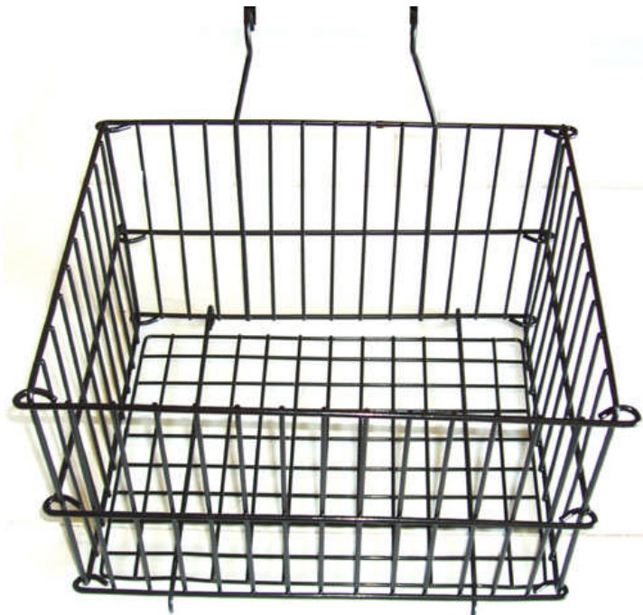
STEP 4 – SWING BOTTOM AROUND AND HOOK OVER