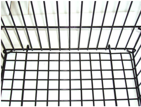
CLOSE UP OF BOTTOM HOOKING OVER SIDE