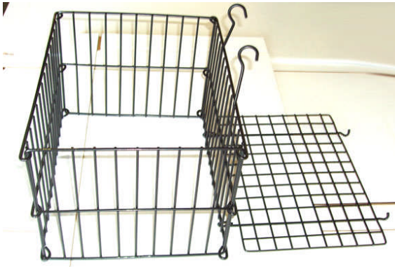
STEP 3 – POP SIDES OF SPORTSBASKET UP