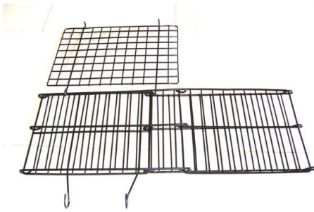
STEP 2 – FOLD BOTTOM UP AS SHOWN IN DIAGRAM