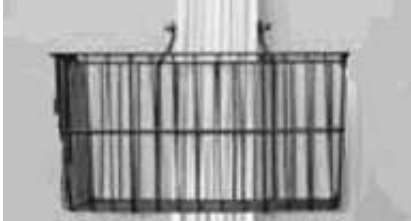
Sports Basket on Aluminum Rack

The GEARUP™ Sports Basket is designed to fit all GEARUP™ Aluminum Floor to Ceiling, GEARUP™ OAK Floor to Ceiling (Model 20095), and GEARUP™ OAK Free Standing (Model 20093) Bicycles Storage Racks.